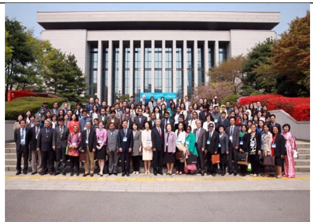
4 th ICoASL, 22-24 April 2015, Seoul, South Korea