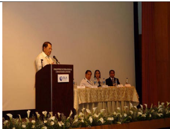
3 rd ICoASL, 10-12 April 2013, Manila, Philippines