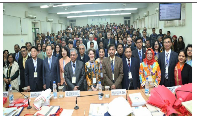
6 th ICoASL 14-16 February, 2019, Delhi, India