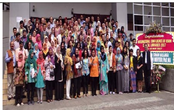
5 th ICoASL, 9-12 May 2017, Yogyakarta, Indonesia