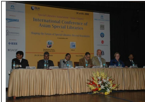
1 st ICoASL, 26-28 November 2008, Delhi, India