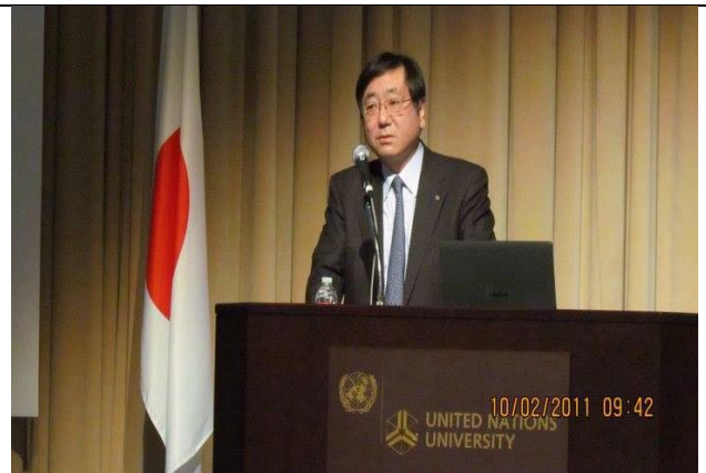
2 nd ICoASL, 10-11 February 2011, Tokyo, Japan